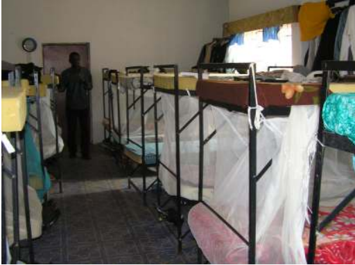
One example of the accommodation