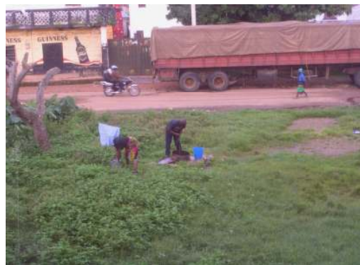
From the hospital accommodation

The area 'travelled through', mode of travel and accessibility to people while going from college or hospital to the accommodation for each was also quite different:-