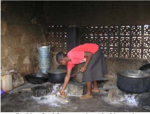
Cooking food for approximately 90 people