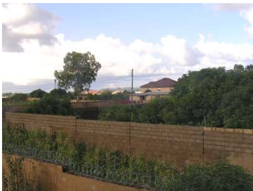
From the Bible college accommodation

The opportunity to spend some time at Faith Alive hospital was offered to me soon after I arrived. This meant I would be spending some time staying in a flat close to the hospital. At first I wasn't sure I wanted to be involved in an actual hospital but this proved to be a very valuable experience. It gave me an opportunity to see much more of the everyday life of the local people than if I was just based at the Bible College. One example of this can be seen from comparing the view from my bedroom window at both locations:-