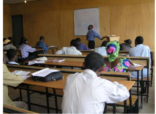
In a lecture

Being a country girl at heart I enjoyed a trip we did into the country.