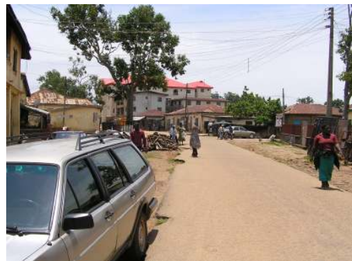
Taken while walking between hospital and flat.