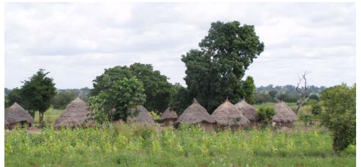
A typical village on the way from Wukari to Yola