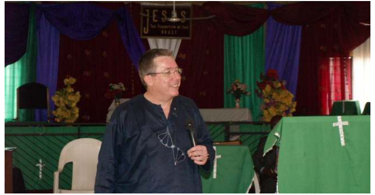
Kent sharing in the Anglican Church at Wukari