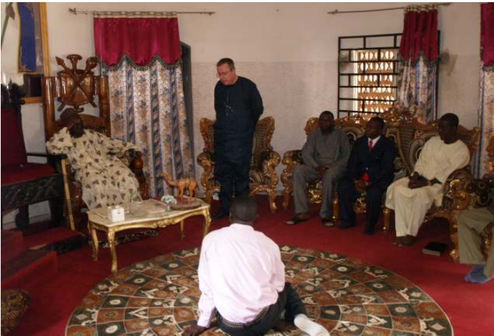
We visited the king of Wukari. We spoke about peace and the expansion of the gospel in the region. We prayed with him and took photos. We ended up being informal and close.