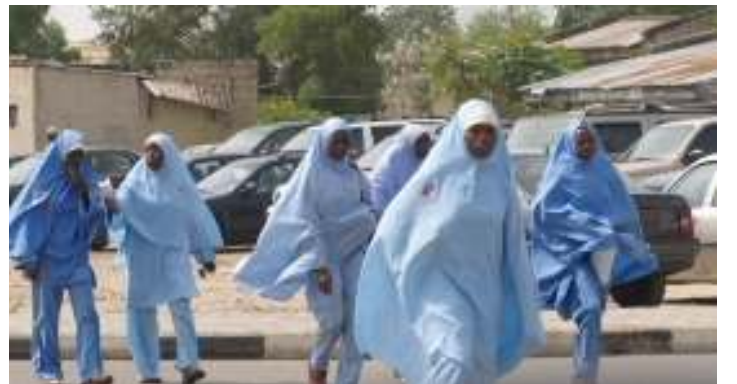
A typical scene, as children leave school in the afternoon

We arrived back in Jos after a 10 hour drive from Yola, through beautiful country. The students at Jos are very keen and are studying very hard. It is great to be back with them and all the staff. We have had two babies born to staff the last month. They are all doing well.