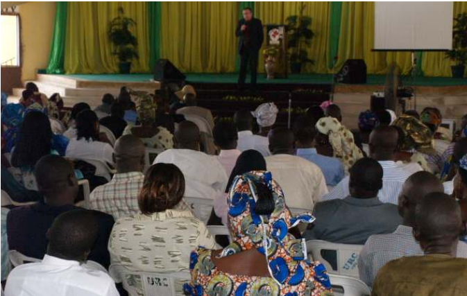
Kent speaking at a church in Yola. This meeting was put on prime time television to reach the whole city of Yola.