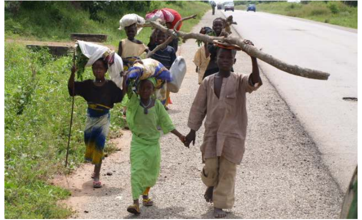
Children on the road as we travelled to Yola